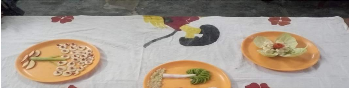
CUTTING OF FRUITS

Address: New Colony, Dewan Bazar Gorakhpur -273001