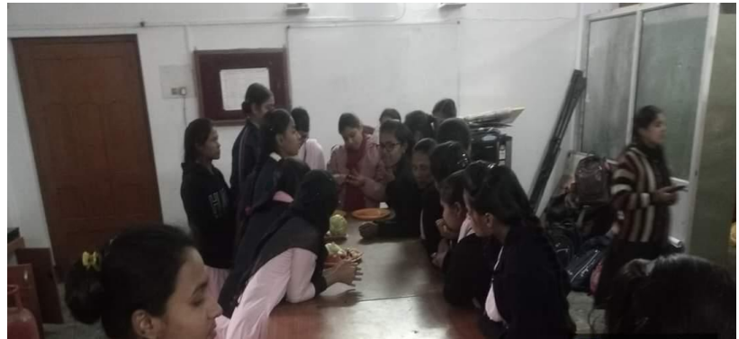
CUTTING OF VEGITABLE