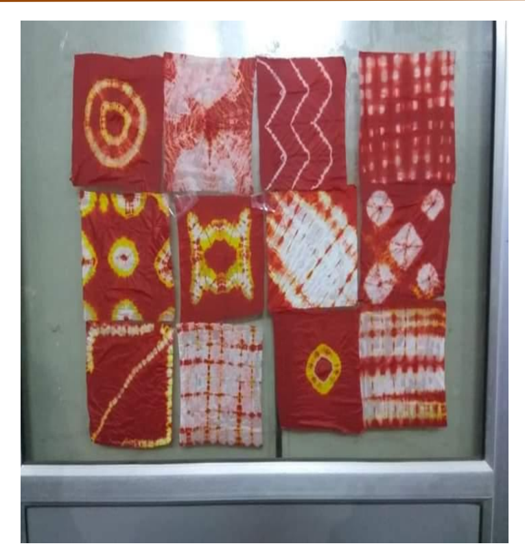
STUDENT LEARNING ABOUT DYEING & PRINTING